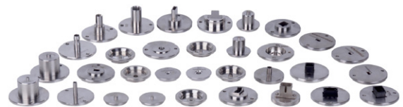
Series of Adaptors