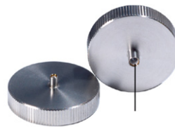
Embedded Ceramic Sleeves

Easycheck can check connectors, modules(TOSA、 ROSA), and the adjustable version can check multi-fiber connectors.