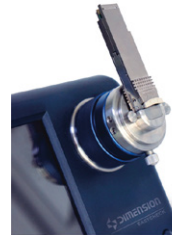
40G&100G Transceiver Module