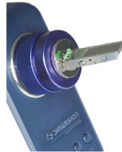
LC Transceiver Inspection