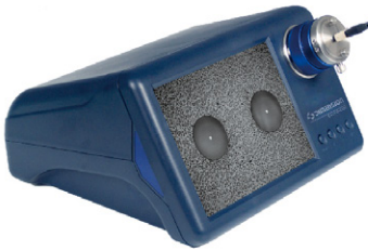
MPO Connector Inspection

Easycheck has an extensive range of adaptors and can check all kinds of fiber connectors ( MPO/MTP, MT-RJ connector ), Optic transceiver Module ( 40G -100G MPO Module, SFP, XFP, QSFP ) , TOSA/ROSA components and so on.