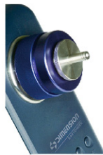
TOSA & ROSA Inspection