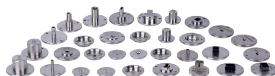
Series of Adaptors