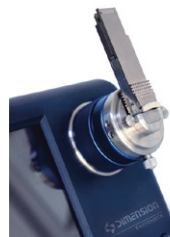
40G&100G Transceiver Module